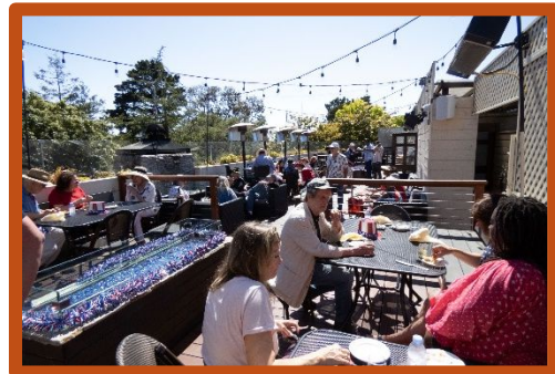
July 4 on the patio of Vesuvio’s in Carmel after a free, live concert in Devendorf Park, Carmel.