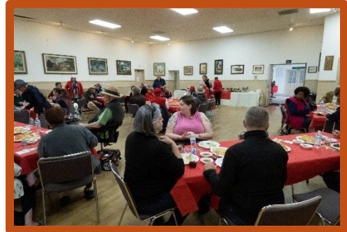
Memorial Day at The House of Four Winds (Monterey Civic Club) across from Colton Hall, Monterey.

If you were one of our valued Patrons of the Pops! members, you would have enjoyed our two “thank you” member events. Visit our website and consider joining!!!